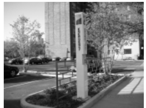
University of Chicago Police currently have 305 E-phones located throughout the neighborhood for anyone to use in the event of emergency.

SECC data is based on Chicago Police Department reports. Violent Crime is defined as murder, aggravated criminal sexual assault, robbery, and aggravated assault and battery.