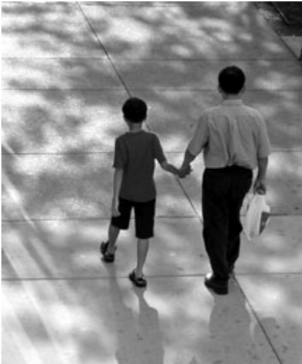
Many communities use meter revenue to make an area more pedestrian friendly.